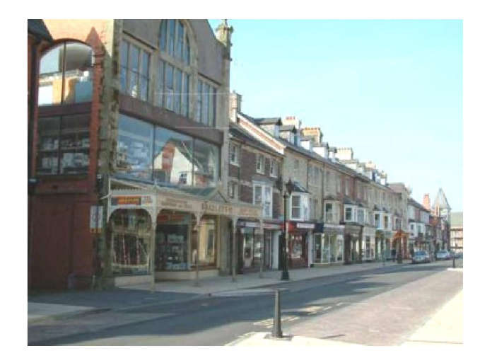
Above: Llandrindod Wells