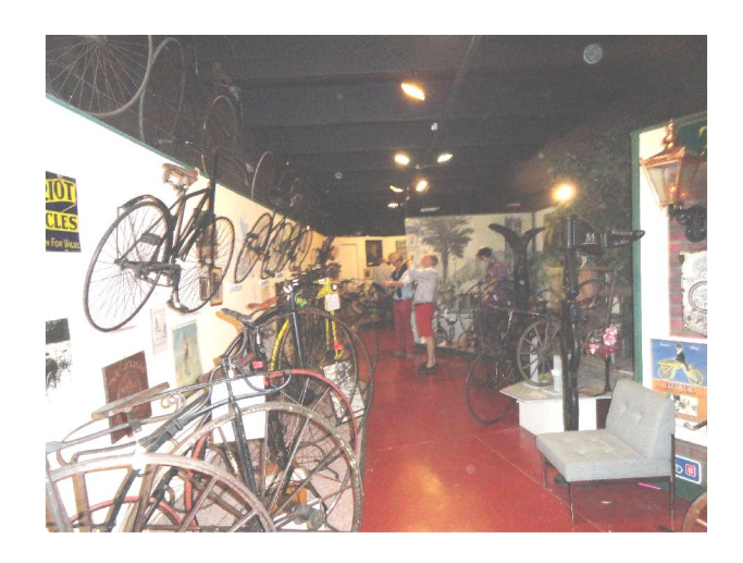
Above: National Cycle Museum