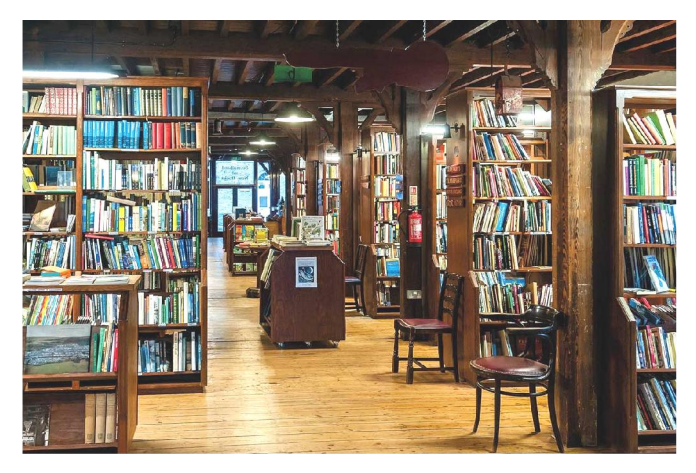
Hay-on-Wye Book Shop